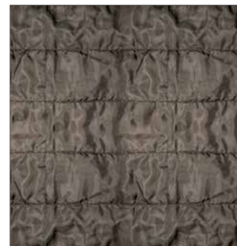
POLYESTER PADDED LINING