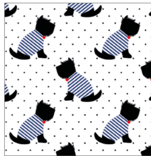
PRINTED POLYESTER LINING