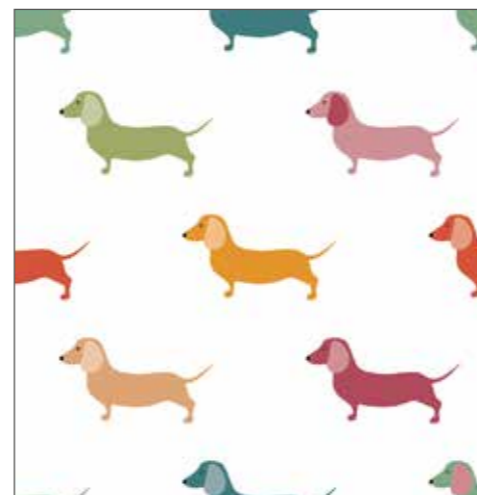
PRINTED POLYESTER LINING