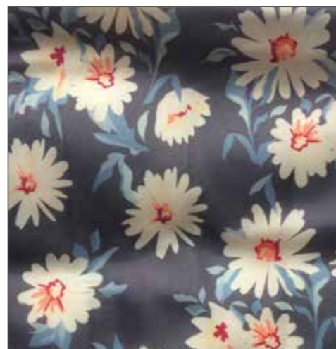
PRINTED POLYESTER LINING