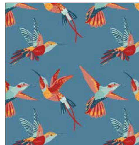
PRINTED POLYESTER LINING