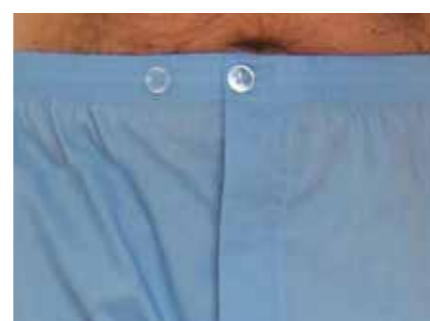
ELASTICATED WAIST WITH BUTTON