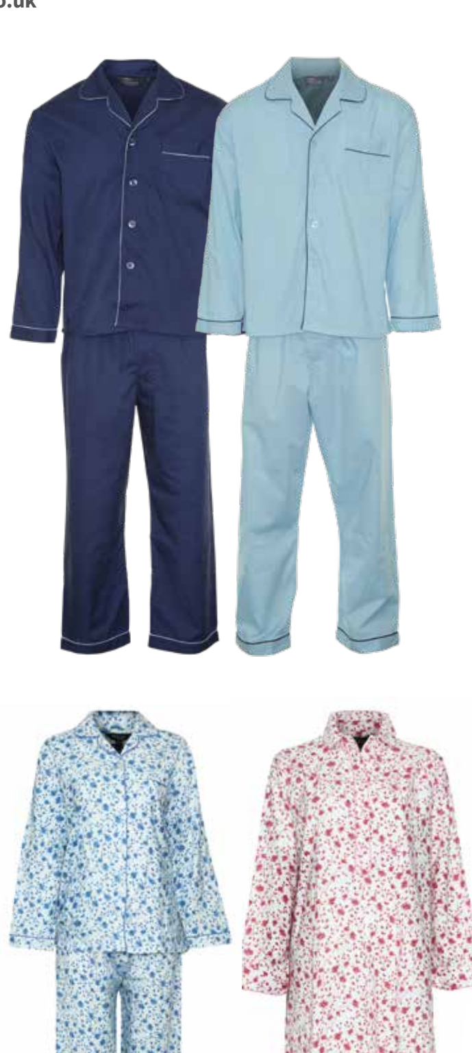
Champion , nightwear