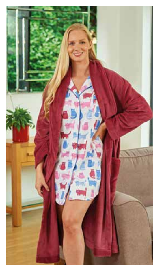
MATCHING PARIS NIGHTDRESS AND PYJAMAS AVAILABLE. SEE PAGE 20 & 22.