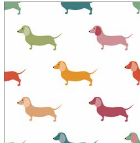
PRINTED POLYESTER LINING