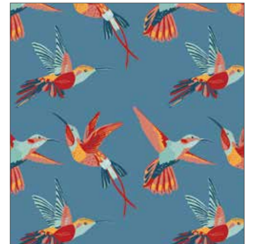
PRINTED POLYESTER LINING