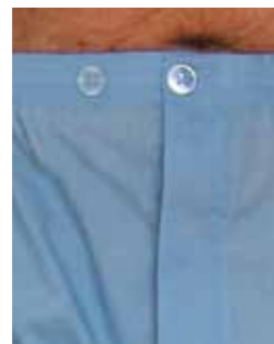
ELASTICATED WAIST WITH BUTTON